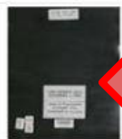
Alphabetical index to lando...